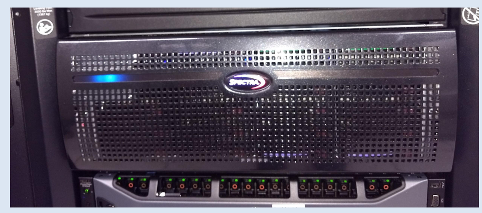
University of Minnesota